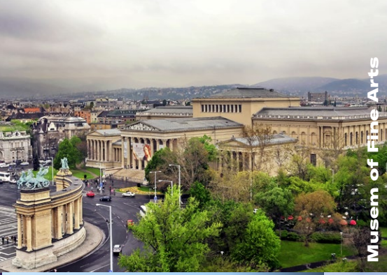
Museum of Fine Arts