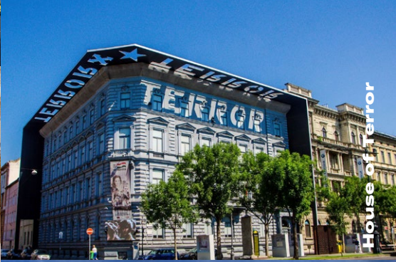
House of Terror