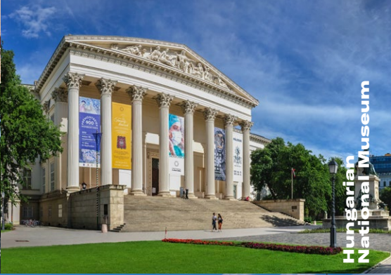
Hungarian National Museum