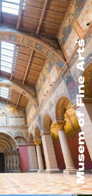
Museum of Fine Arts