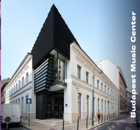
Budapest Music Center